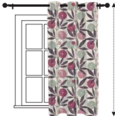
Below Sill Length 10cm below sill