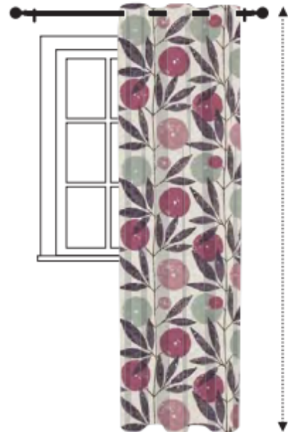
Full Length 1cm from the floor