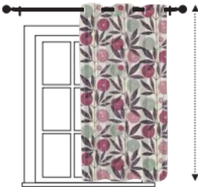
Sill Length 1cm above sill

Please note for Eyelets headings only: we will add a 2cm upstand of fabric above the eyelet